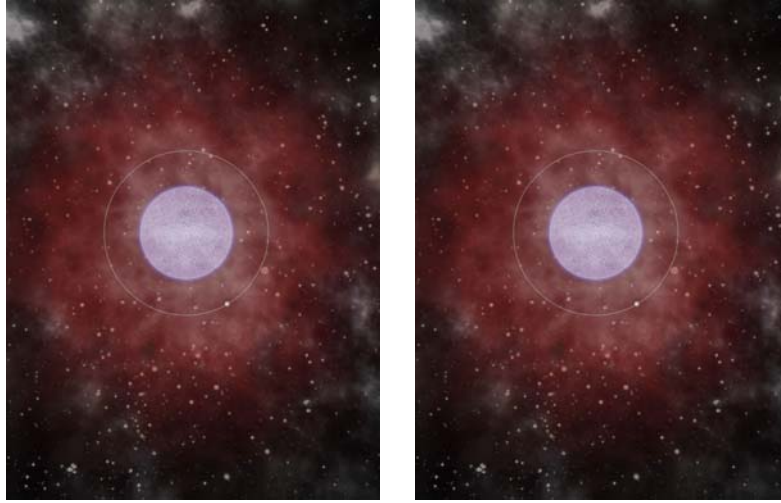
Fig. 2 Scenarii illustrating two possible configurations of INTEGRAL sources, with a neutron star orbiting around a supergiant star on a circular orbit (left image), and on an excentric orbit (right image), accreting from the clumpy stellar wind of the supergiant. The accretion of matter is persistent in the case of the obscured sources, as in the left image, where the compact object orbits inside the cocoon of dust enshrouding the whole system. On the other hand, the accretion is intermittent in the case of SFXTs, which might correspond to a compact object on an excentric orbit, as in the right image. A 3D animation of these sources is available on the website http://www.aim.univ-paris7.fr/CHATY/Research/hidden.html .

temperature of T \sim 31\,000 K: the system is therefore an HMXB (Pellizza et al. 2006). Rahoui et al. (2007) combined optical, NIR and MIR observations and showed that they could accurately fit the observations with a model of an O9Ib star: temperature T = 30\,500 K and radius R_\star = 21.9R_\odot . They derived an absorption A_v = 5.9 magnitudes and a distance D = 3.9 kpc. The source does not exhibit any MIR excess (see Fig. 1, Rahoui et al. 2007). In summary, IGR J17544–2619 is an HMXB at a distance of \sim 4 kpc, constituted of an O9Ib supergiant, with a mild stellar wind and a compact object which is probably a neutron star, without any MIR excess.